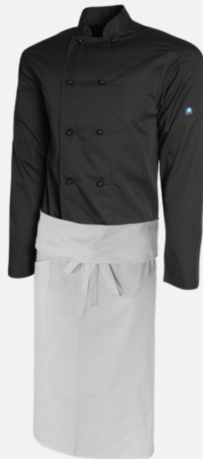
# CBAPN002 white