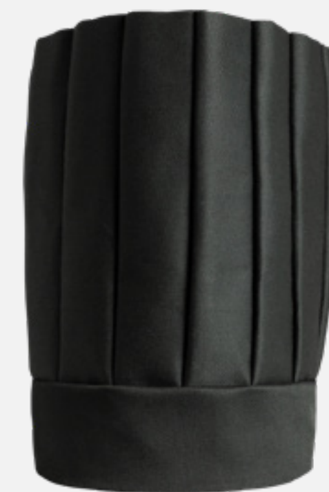
# CBHW001 black