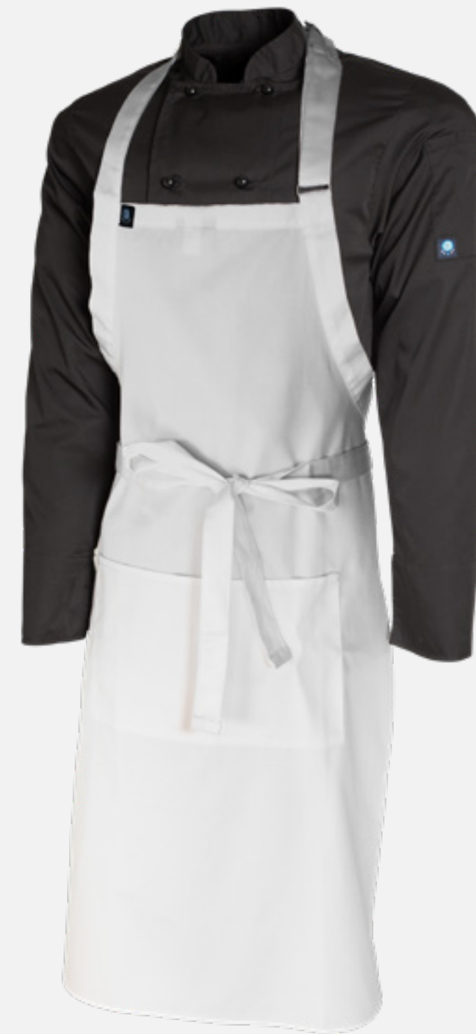
# CBAPN003 white