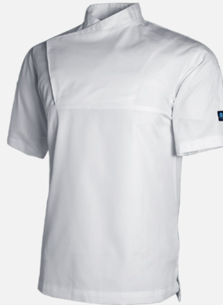
# CBJKT001 white