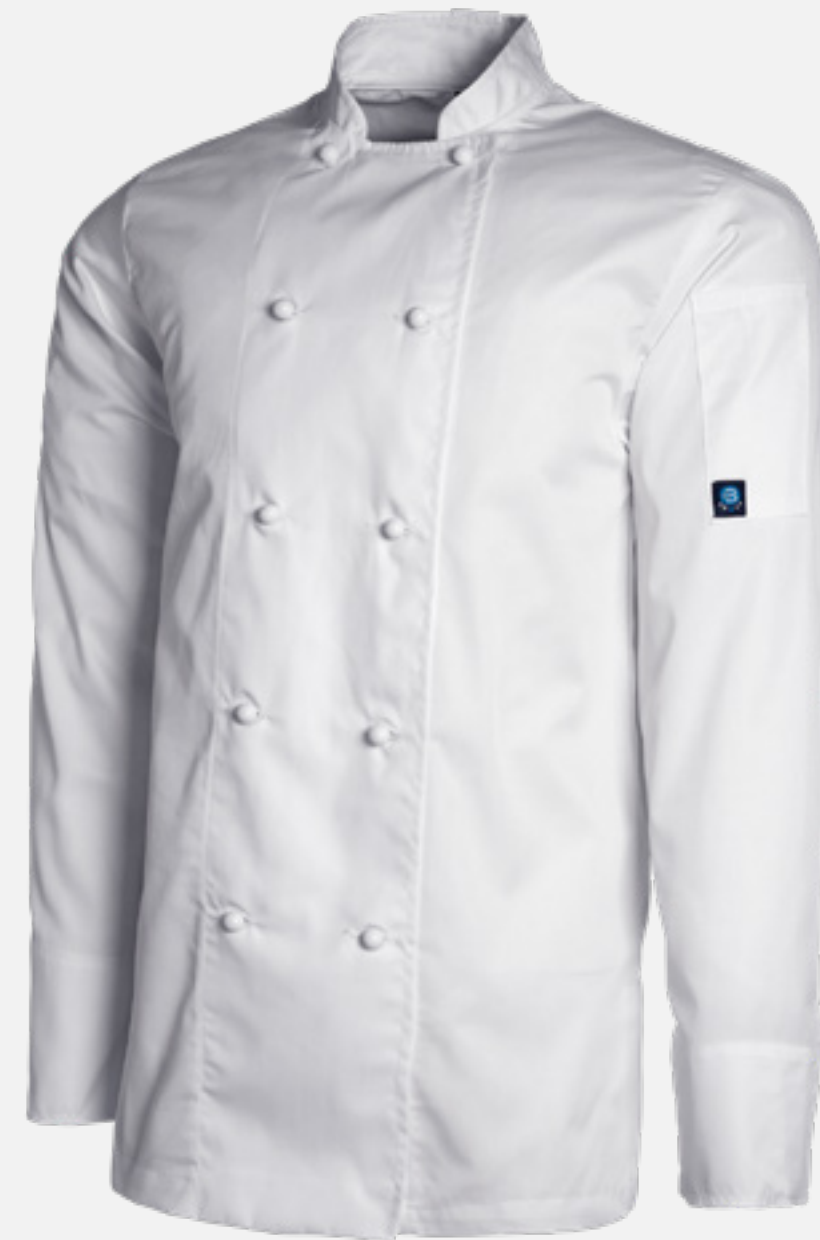
# CBJKT002 white