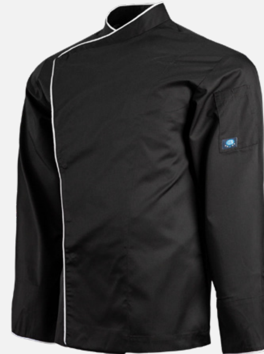
# CBJKT006 black & white piping