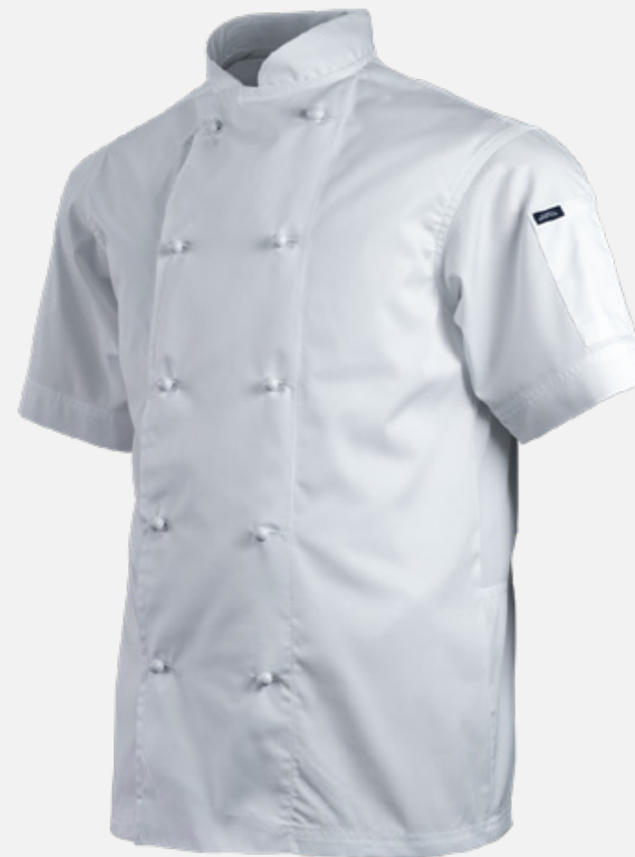
# CBJKT008 white