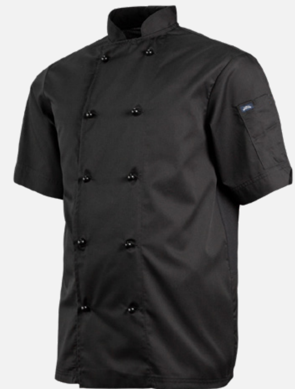
# CBJKT008 black