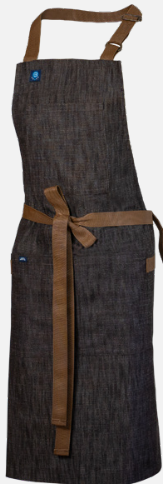
# CBAPN006 tobacco