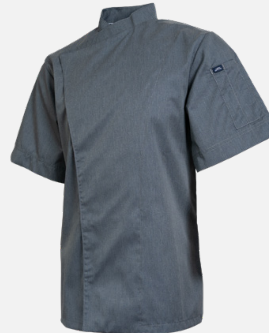
# CBJKT013 charcoal melange