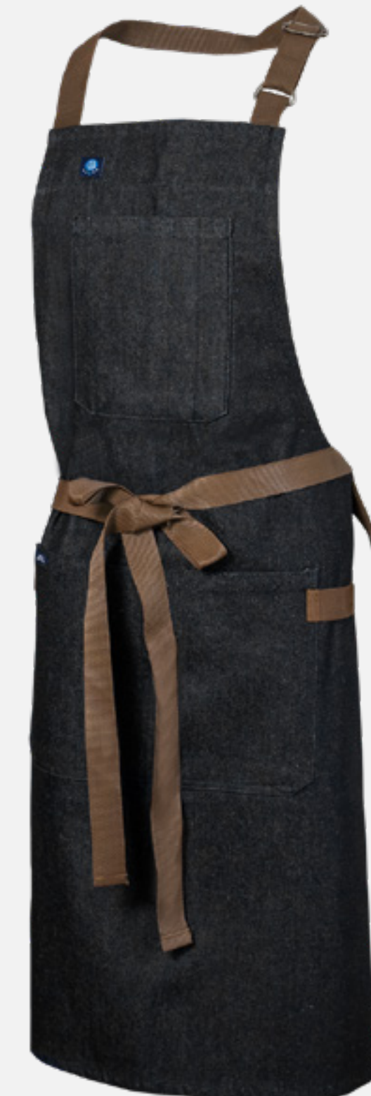
# CBAPN009 michigan black coffee