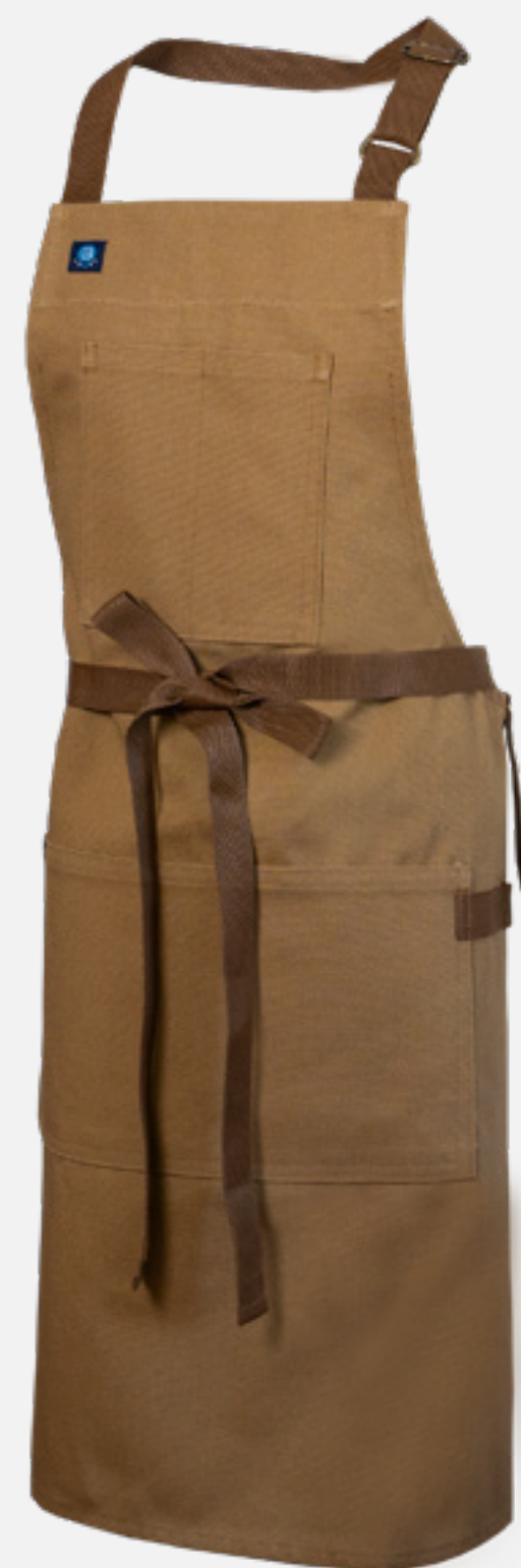
# CBAPN004 fudge