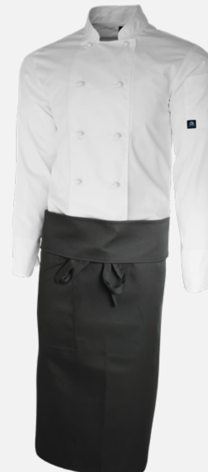
# CBAPN002 black