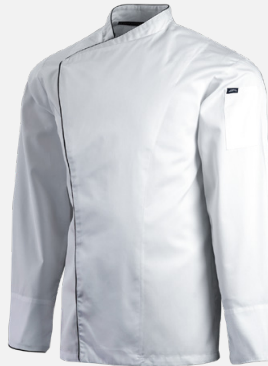
# CBJKT006 white & black piping