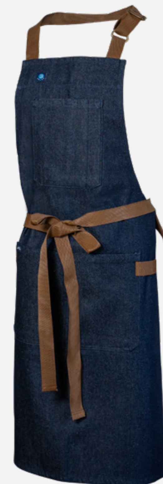
# CBAPN005 denim