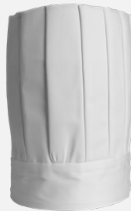
# CBHW001 white