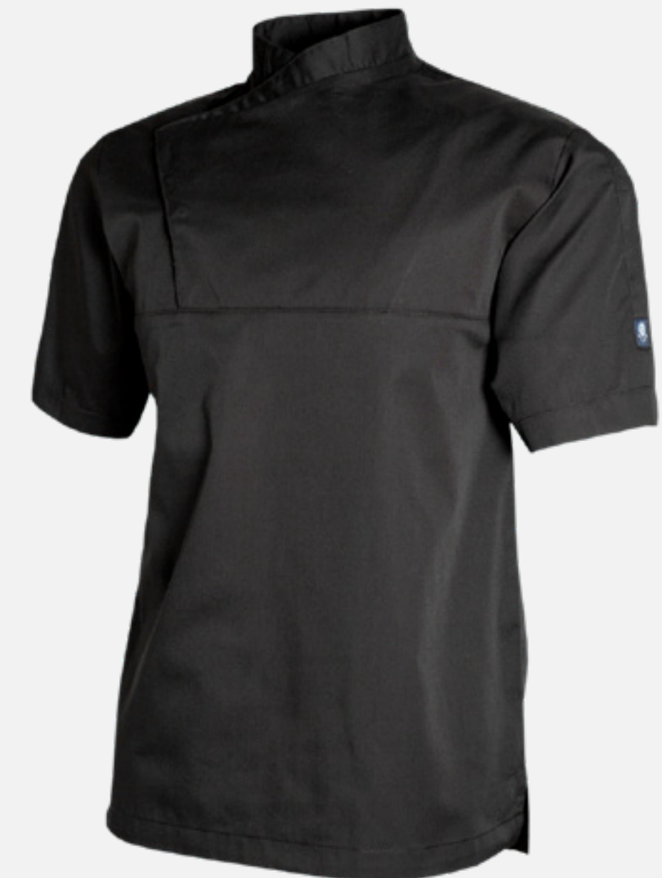
# CBJKT001 black