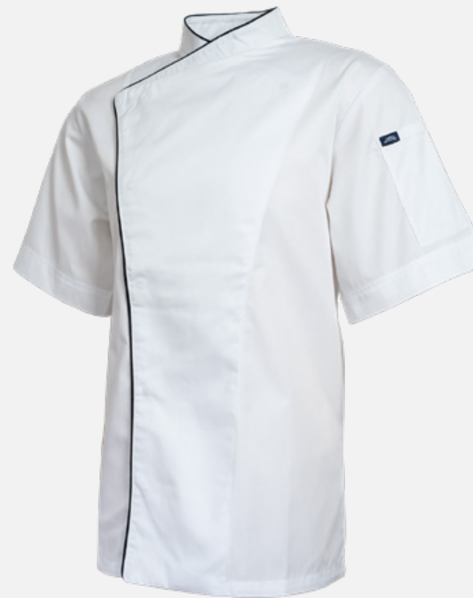
# CBJKT013 white with black piping