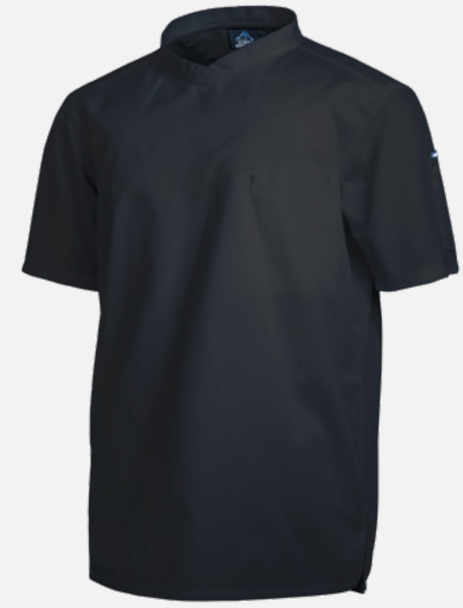
# CBJKT012 black