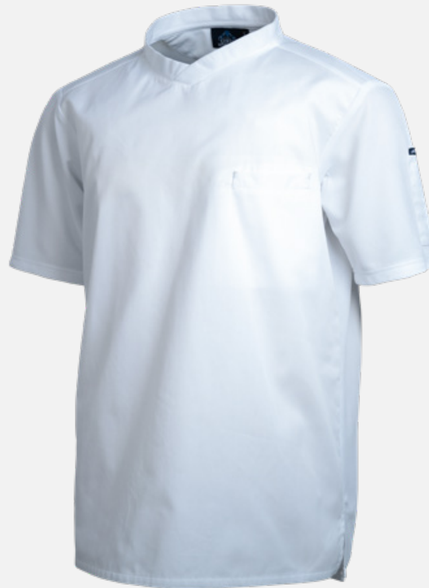
# CBJKT012 white