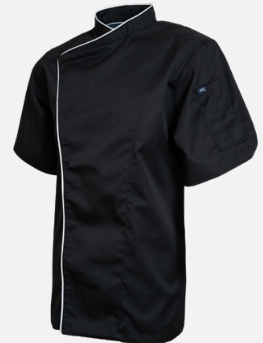
# CBJKT013 black with white piping