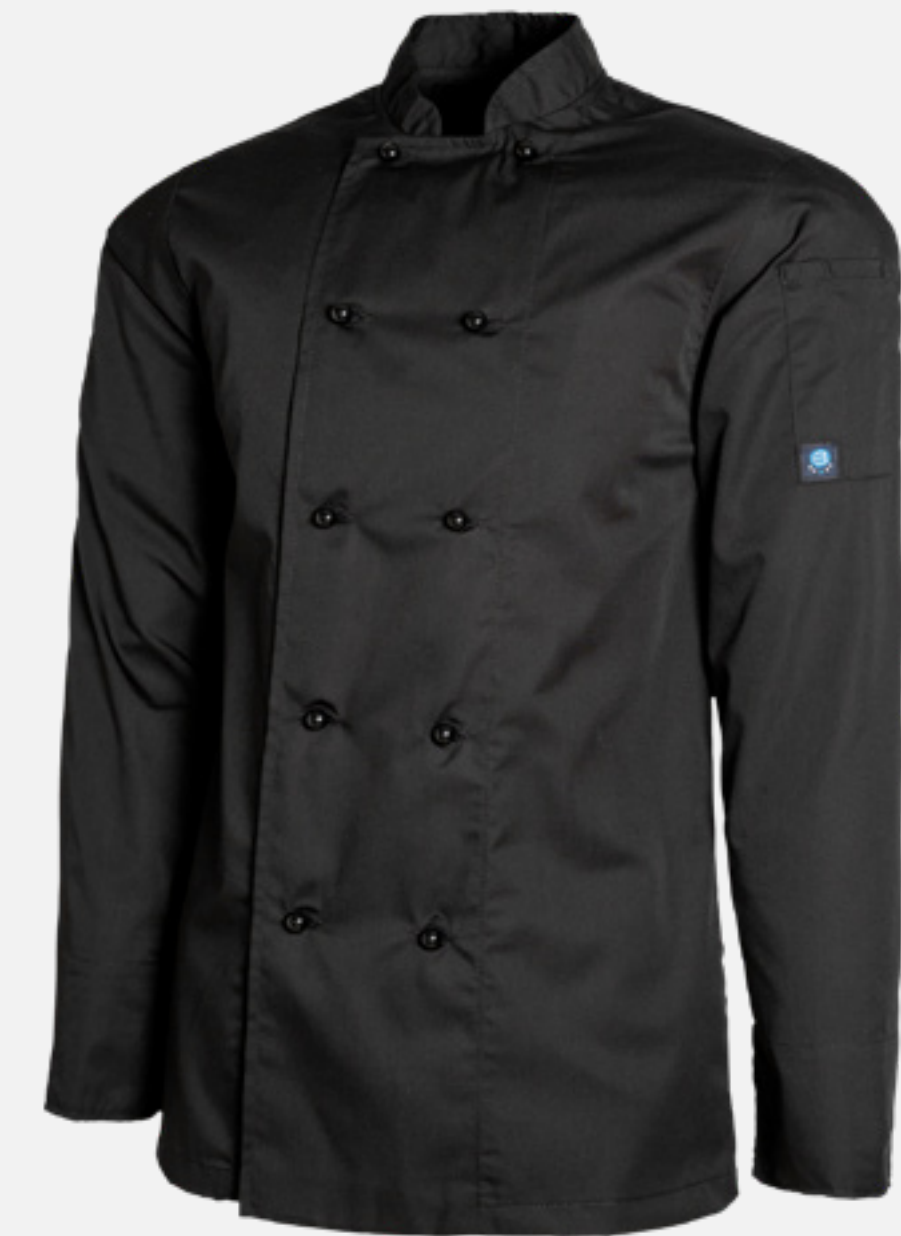
# CBJKT002 black