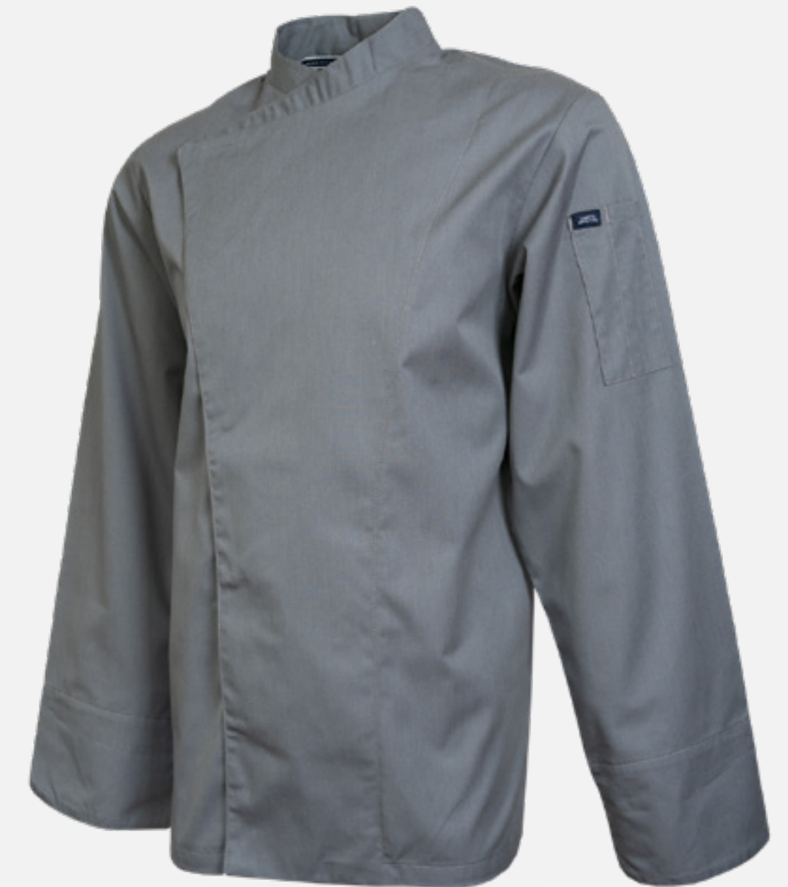
# CBJKT006 ice melange