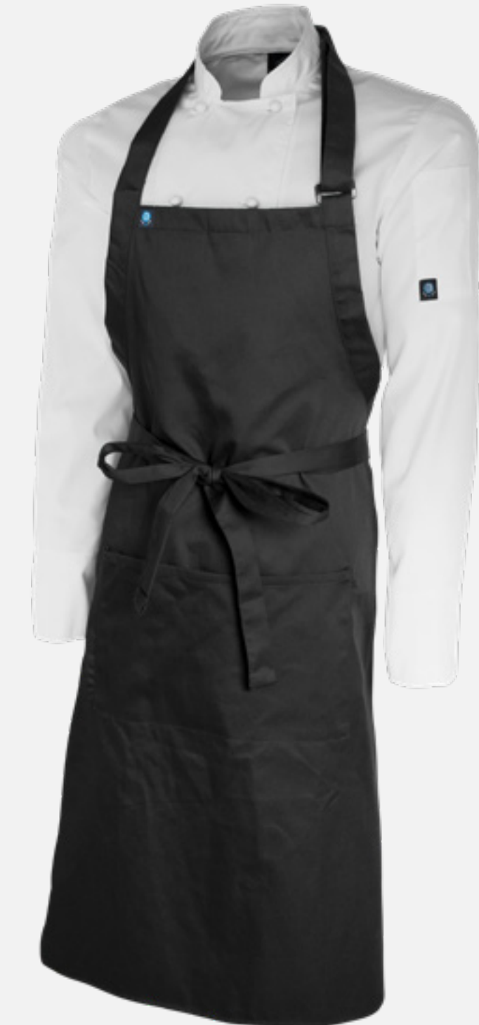
# CBAPN003 black