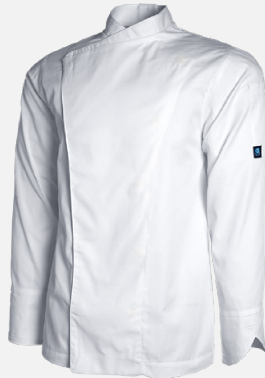
# CBJKT006 white